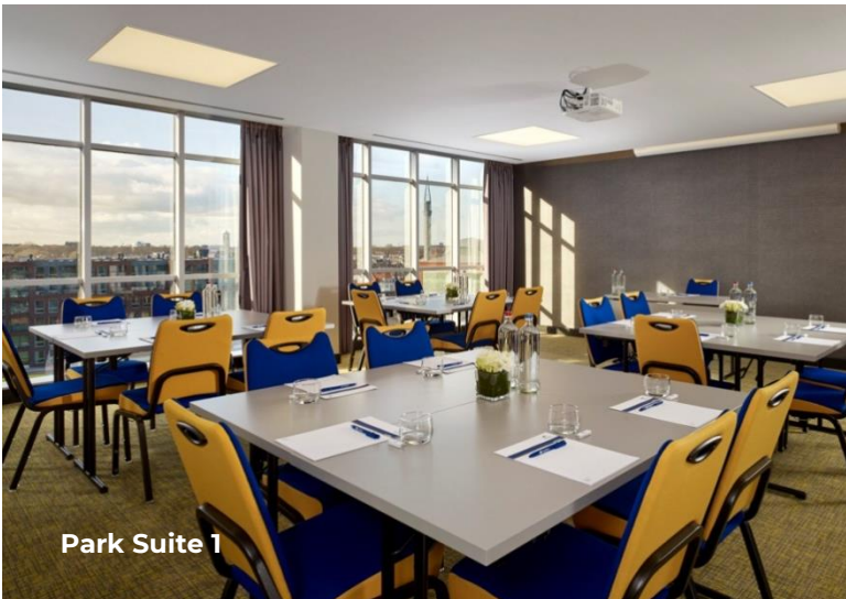
Park Suite 1