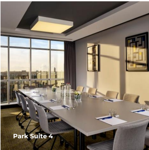
Park Suite 4