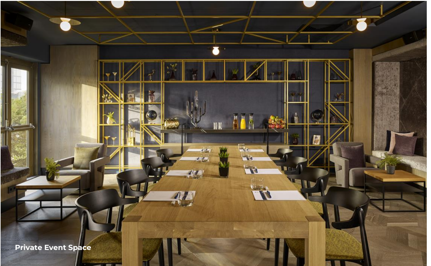
Private Event Space